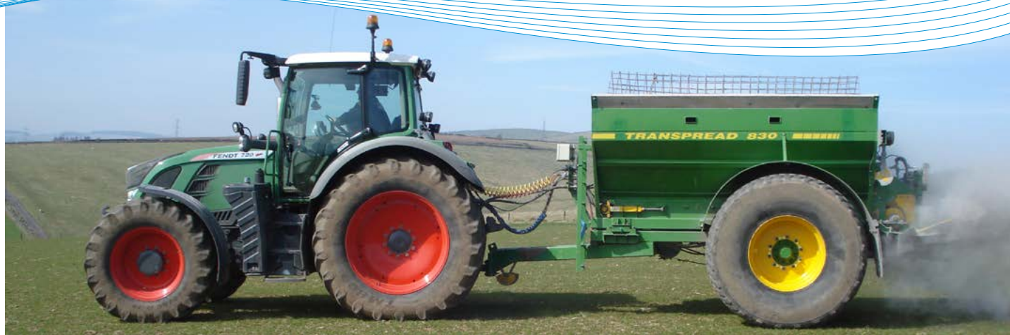
Figure 1. Lime spreading